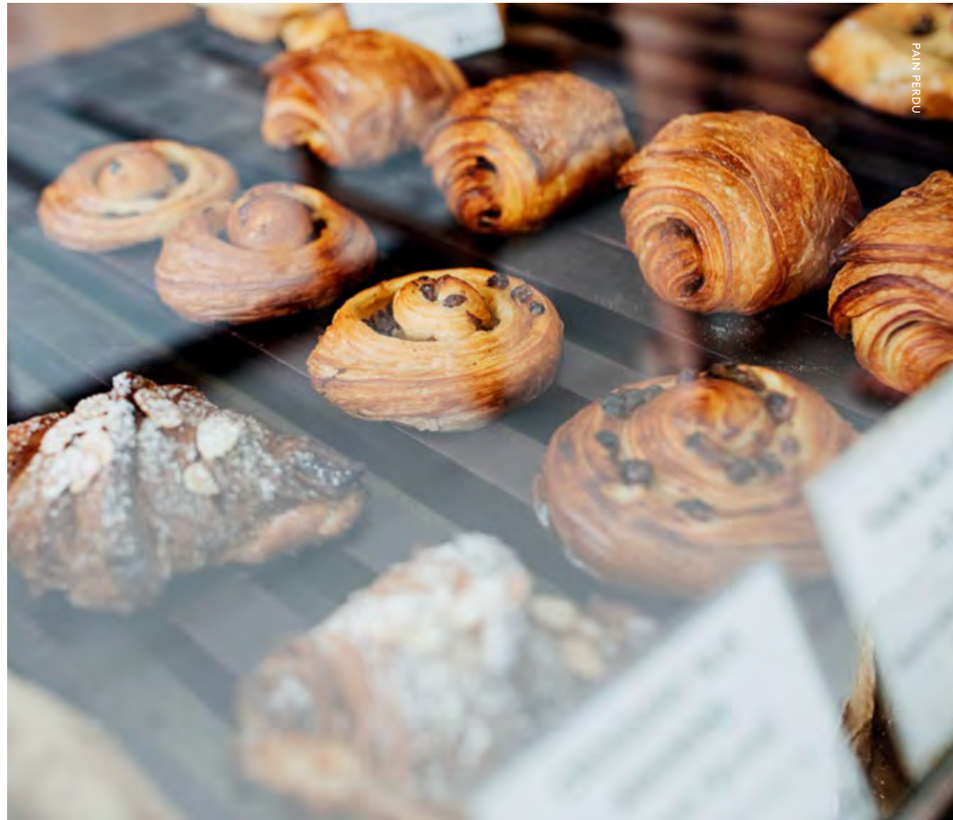
BAKER AND SCONE 693 ST. CLAIR AVE. W.

The origin of the scone is disputed by the Scots and the Dutch, who both claim to have invented it. But whatever theory you subscribe to, you'll find it a pleasant surprise to discover a bakery that specializes in scones. At Baker and Scone, there are 44 varieties of scone available, including eight savoury varieties, some involving cheese. That's because the simple recipe serves as a base for an unlimited number of additions, such as raspberry lemon, pear hazelnut, dried cherry & white chocolate, and salted caramel. Light and fluffy, these scones are best tried warm out of the oven, or buy a half dozen and take them home.